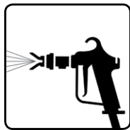
AIRLESS SPRAYER tip size 15 400 PSI