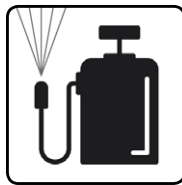
PUMP SPRAYER 3 coats minimum